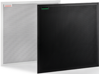
MXA925-60CM Ceiling Array Microphones Front