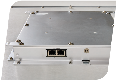
Dual RJ45 Network Ports