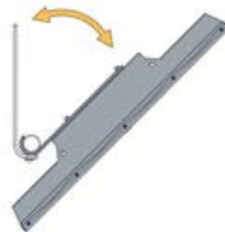
Python-KP52 I+ K-WALL2L